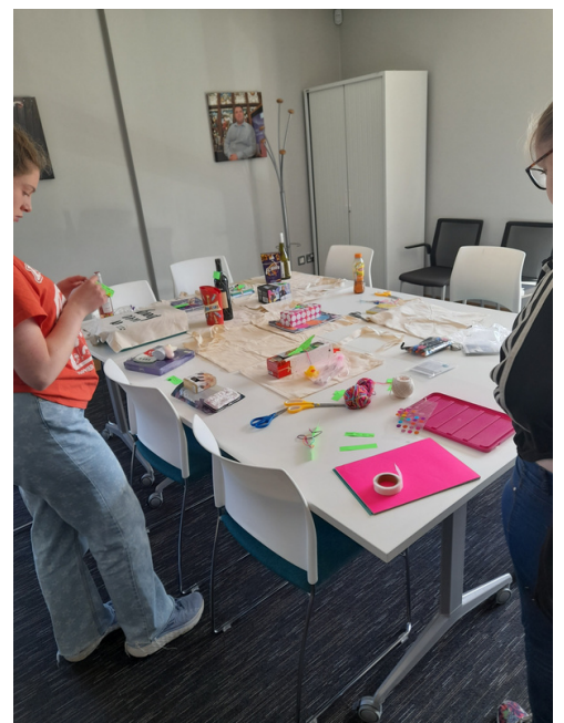
Making our raffle prizes