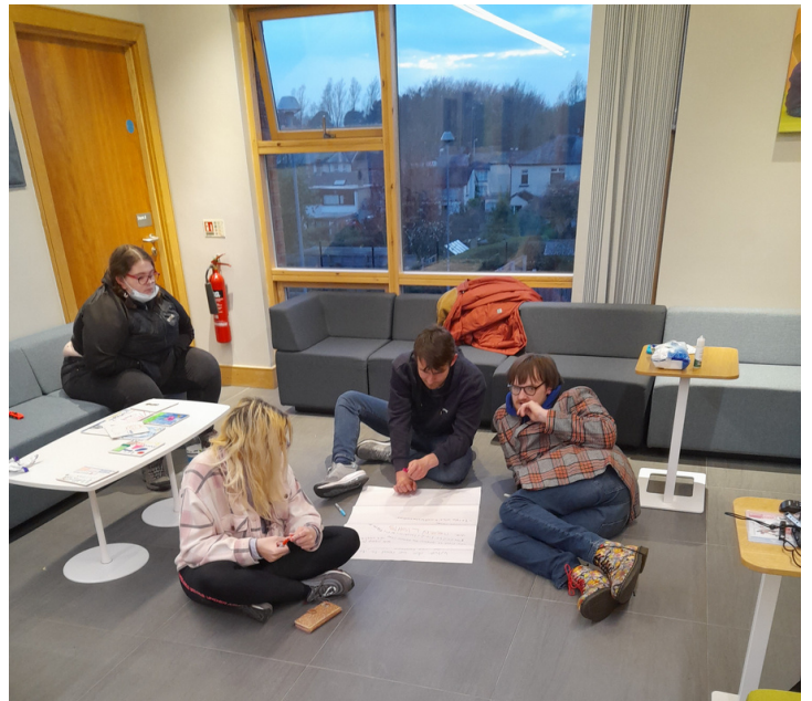
Deep in thought planning all things Trashion

We made car costumes to show how electric cars are better than regular cars for not polluting the planet. The sea monster was to spread awareness