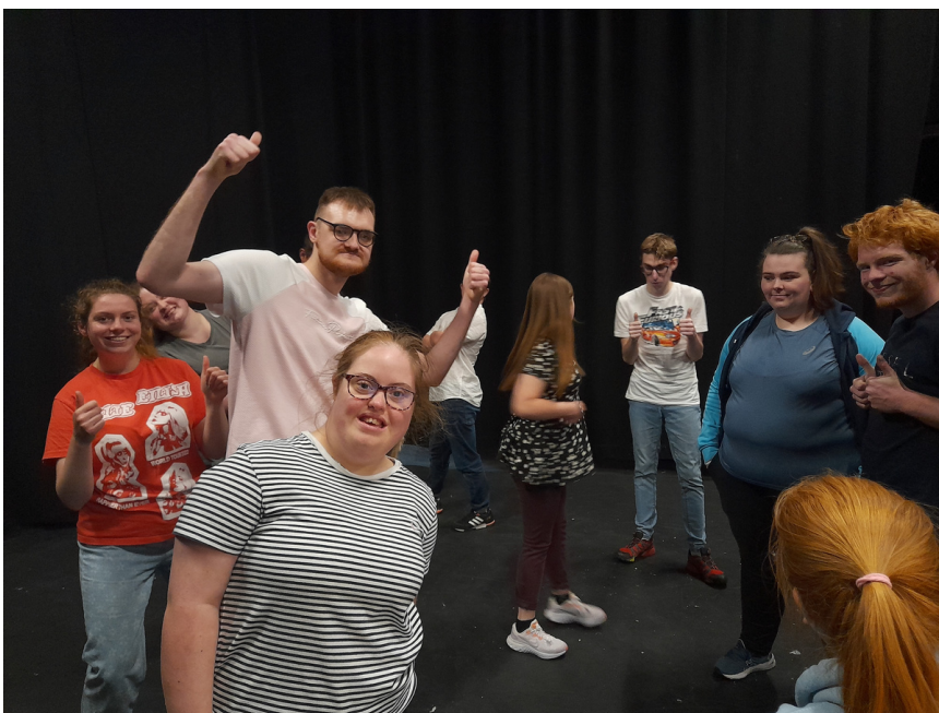
At our rehearsal in Belvoir Studio Theatre

on fish and creatures eating plastic in the sea and the importance of reusing plastic if you have to use it at all. We will show off the pics of all our costumes in the next newsletter!