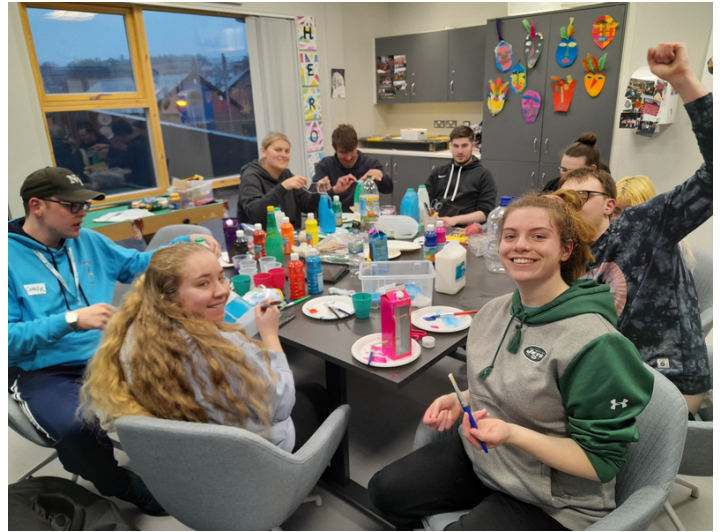
Making recycled bird feeders for earth day

Because people throw away brand new clothes in the dump when they don't want them anymore. People can give them to other people and charity shops instead to stop the planet from getting worse. By using recycled clothes we can reuse them and they won't go to landfill.